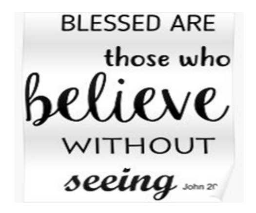
Lord, I believe in your presence with me and within me. Strengthen my belief.

We all have doubts like that from time to time, that's a normal part of living, so we shouldn't begrudge Thomas for having his doubts, when we have had them ourselves from time to time.