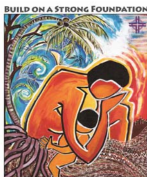
World Day of Prayer - March 5, 2021

This First Friday of March is World Day of Prayer with the theme this year of "Building on a Strong Foundation".