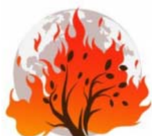
The Burning Bush

Listen to the Voice of Creation SEASON OF CREATION 2022